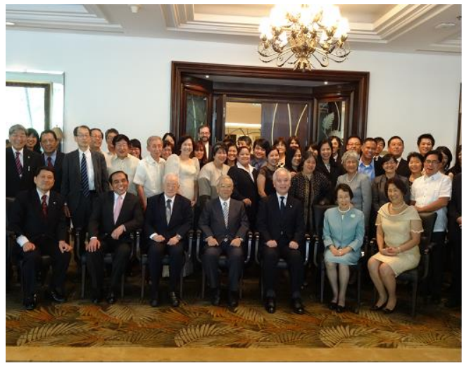
Establishment meeting of Philippines branch (Dec. 20, 2014)

NUAL has established oversea branches in Asian area, and we have now 15 oversea branches (Korea,