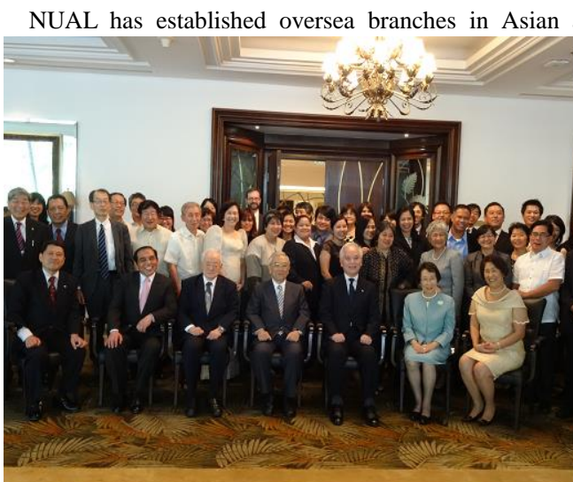
Establishment meeting of Philippines branch (Dec. 20, 2014)